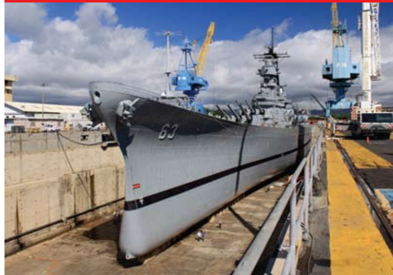
▲ View from bow (note people below)