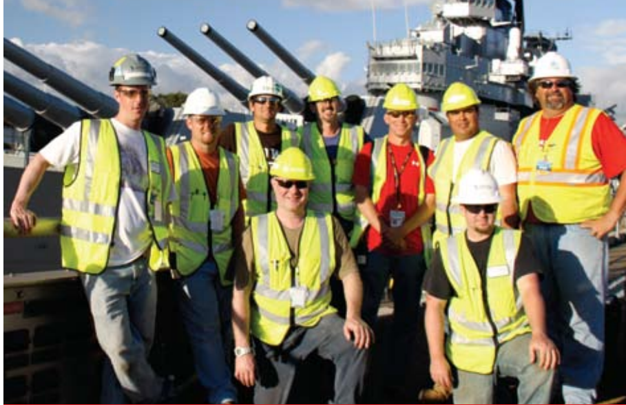
▲ Group shot of scanning crew and support team

Mustang performed the work to perfection, as it has done with more than 60 assignments on upstream and downstream projects. On those projects, Mustang’s laser scanning team collected the data in the field and transmitted the digital image back to a designer for input into 3D modeling software for designing or redesigning facilities. The outcome is unparalleled accuracy and considerable cost savings to the client. While scanning the Missouri was a unique experience for Mustang, it also highlights the capability of Mustang’s laser scanning group and the leading-edge quality of their equipment.