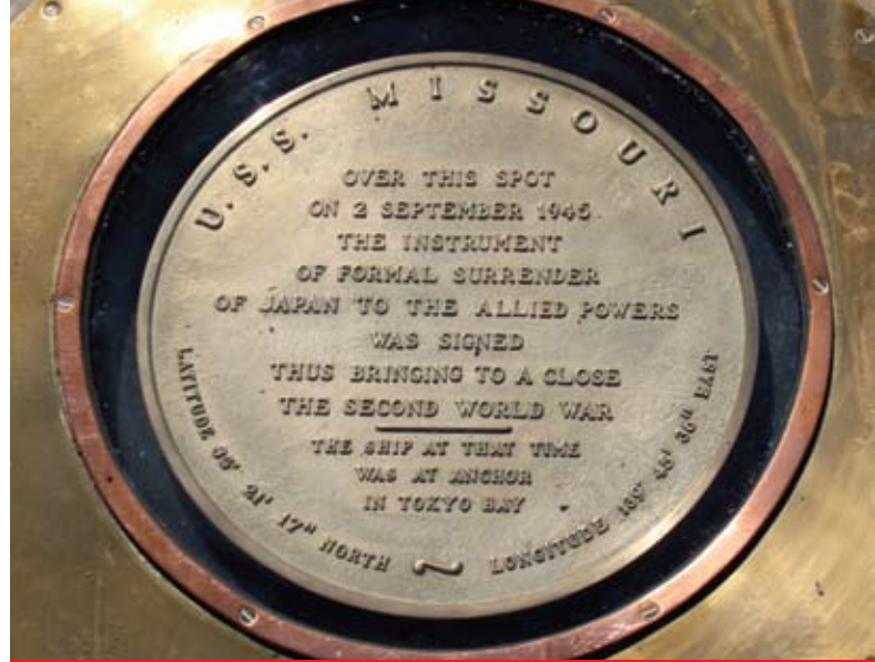
▲ Signing deck monument