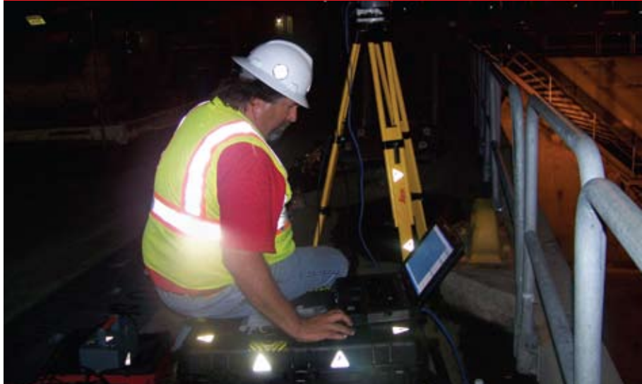
▲ Scanning was continuous, dawn ‘til dark