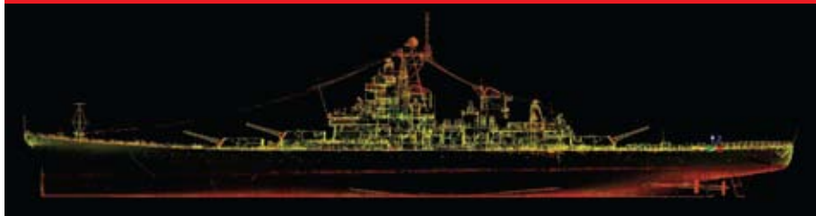
▲ Portside Ortho