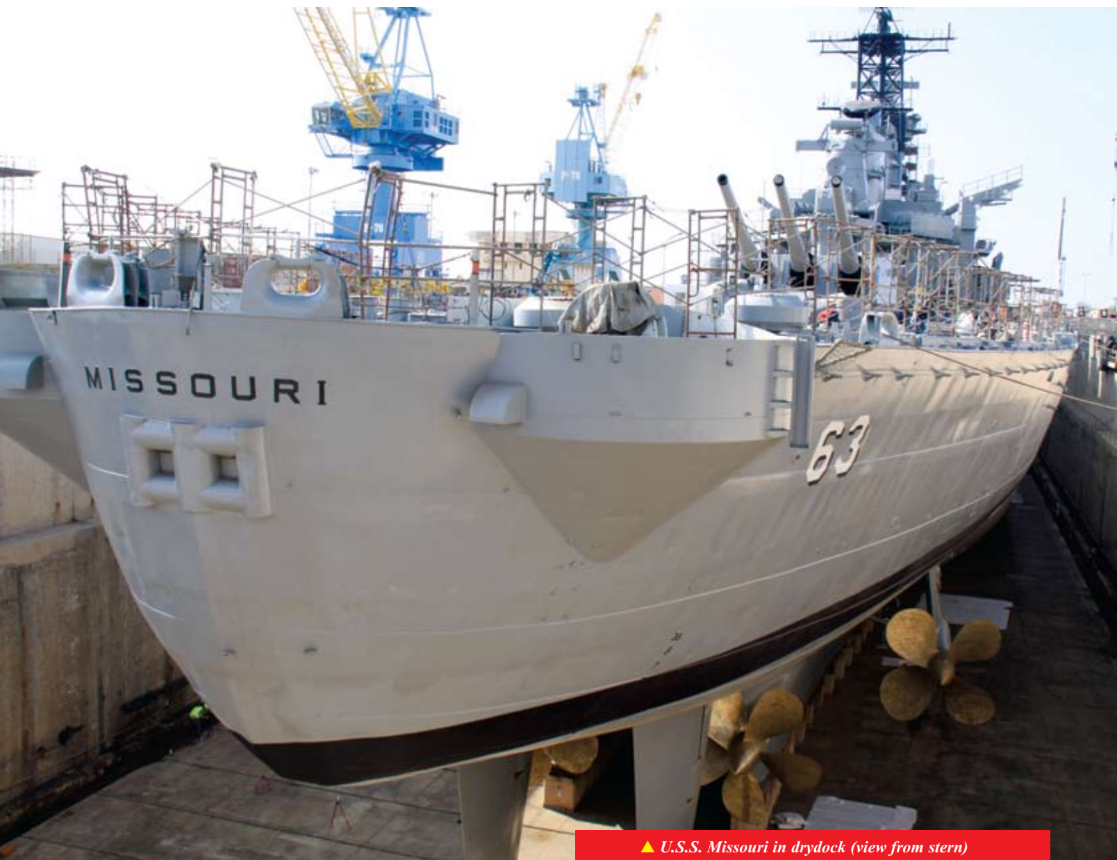
▲ U.S.S. Missouri in drydock (view from stern)

The Missouri is gigantic, measuring more than 880 feet long, 130 wide and 200 feet high. For the work, Stevens used Mustang’s Leica ScanStation II time-of flight scanner to create highly precise, three-dimensional (3D) scans at a \frac{3}{8} -inch grid as required by the project criteria. The scanning camera captured everything in view of a complete 360-degree 3D image, collecting hundreds of thousands of data points each second to create a point cloud that could ultimately be converted into digital imagery. The camera is highly accurate to approximately 300 yards so it could be operated safely from the dock. After scanning from a single reference point, a high definition digital photograph was taken from that location before the camera